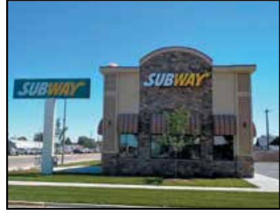
Subway Sandwich Shop – Nampa