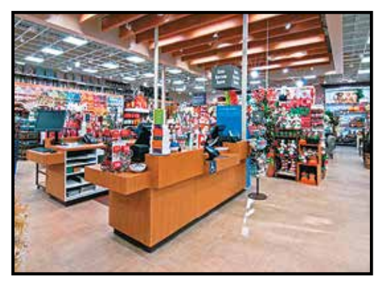
Pier One Imports