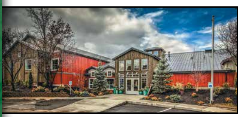
Whitewater Park Apartments Office and Clubhouse