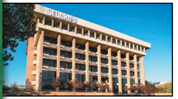
St. Luke's Medical Office Building