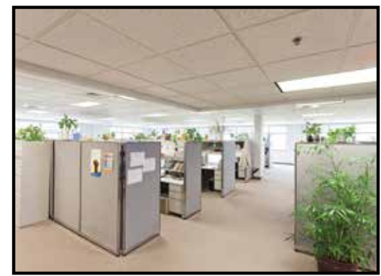
CRI - Solitude Office