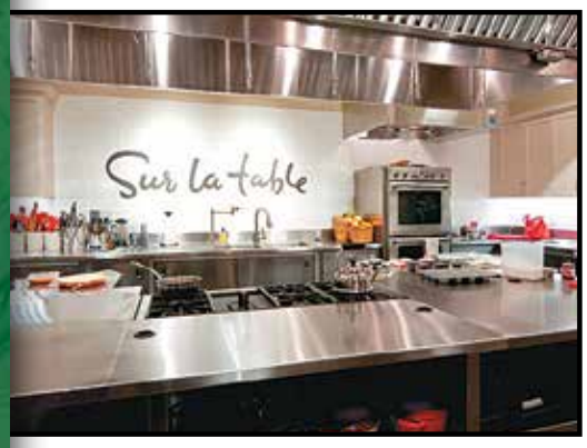
Sur La Table Retail & Recipe Kitchen