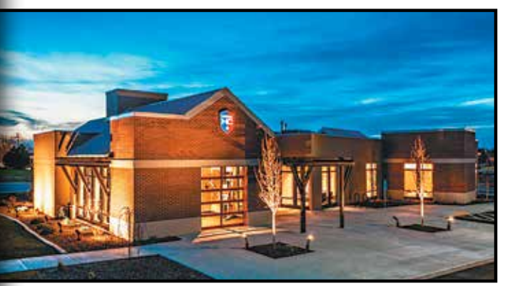
Emergency Responders Health Center