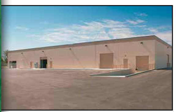
Robertson Supply Warehouse