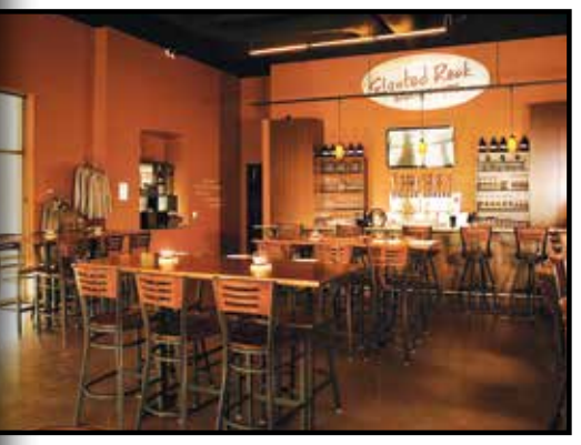
Slanted Rock Brewery-Tasting Room