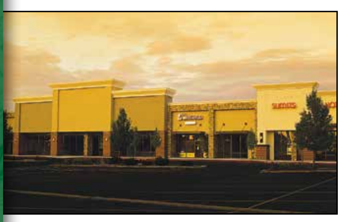
Plantation Shopping Center Facade