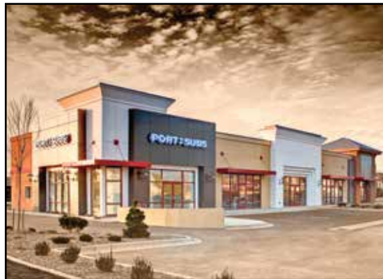
Columbia Trust Retail Center