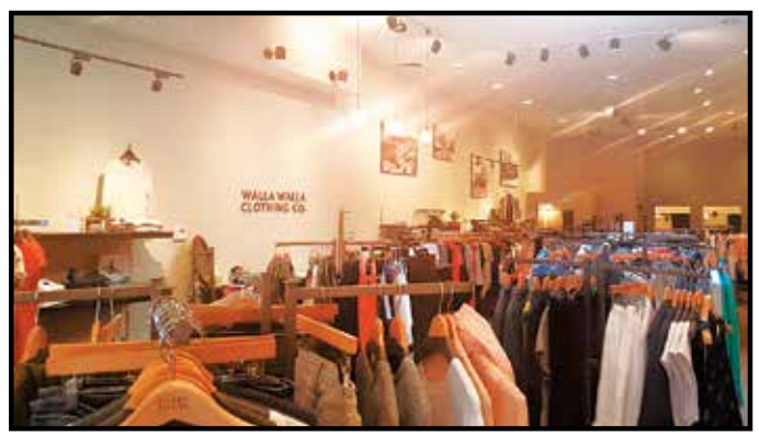
Walla Walla Clothing Company