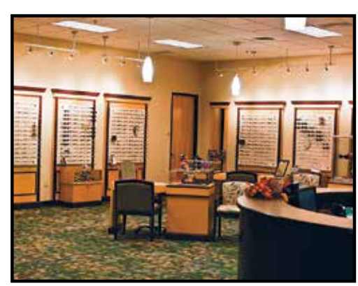
Intermountain Eye Clinic