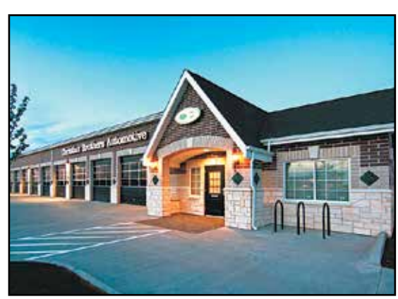
Christian Brothers Automotive