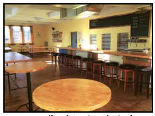
Woodland Empire Ale Craft