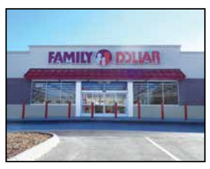
Family Dollar - Nampa/Cascade