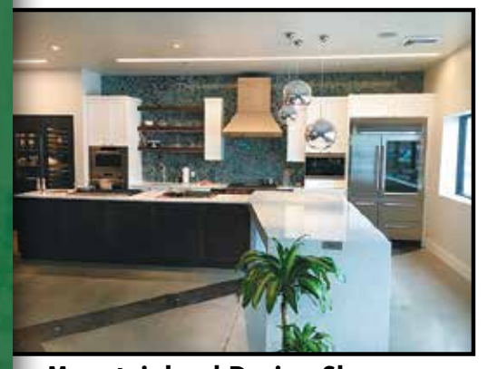
Mountainland Design Showroom