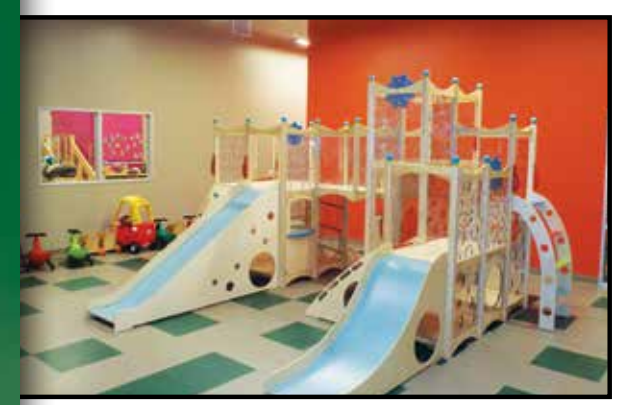
YMCA Child Development