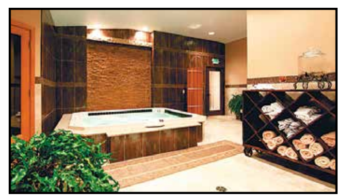
Ex-Hale Salon & Med-Spa