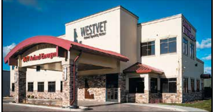
WestVet Animal Emergency & Surgical Clinic